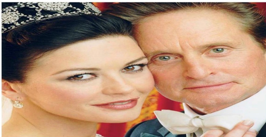
Catherine Zeta-Jones and Michael Douglas